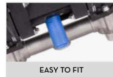
EASY TO FIT